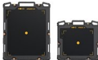
Bildeplate med hard beskyttelse type ARMOR