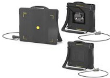
Bildeplate med soft beskyttelse